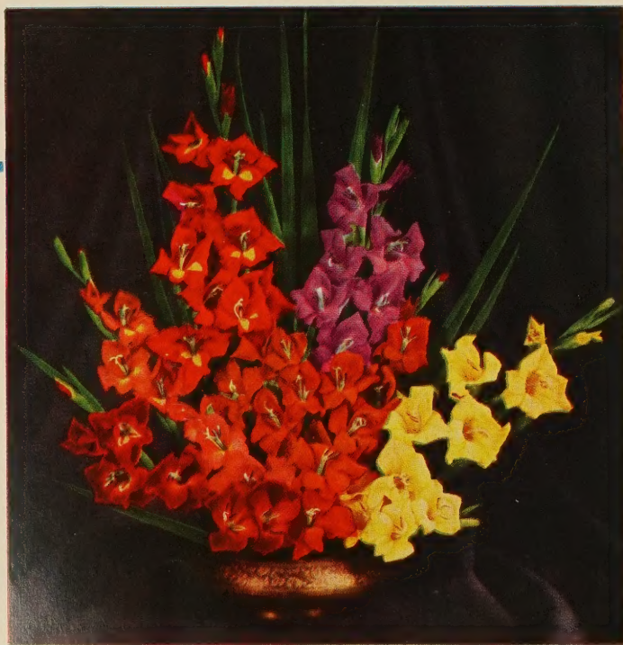
Small-flowered Gladiolus make unusual table arrangements